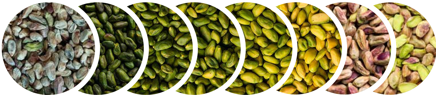
EARLY PICKED GRADE S GRADE A GRADE B GRADE C GRADE D PISTASHIO KERNEL SPLIT KERNEL